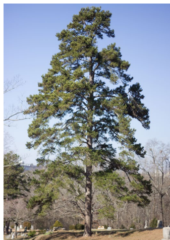
Figure 5: Shortleaf as an attractive landscape specimen at a Georgia site.

10–20 years. By age 20, its growth rate becomes close to that of loblolly pine and around age 50 is greater. 10 The steady growth rate and the species greater lifespan favor long rotations. 9 Shortleaf is shade intolerant. Foresters usually manage it as an even aged stand. It persists in very dense stand conditions and responds to release thinning even when the trees are mature. 6,13 Shortleaf tolerates competition longer than loblolly pine. Control of understory competition increases the growth rate. Its growth rate and sprouting ability is similar to