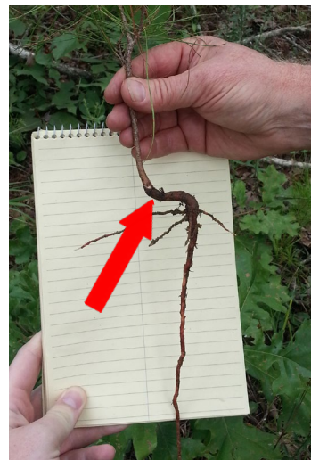
Figure 3: This shortleaf seedling shows the species' unique basal crook (arrow indicates), where it sprouts from following fire damage.

Shortleaf pine is a valued timber tree. Its wood quality, including the juvenile wood, is superior to loblolly pine. The qualities required for high grade sawtimber include; straightness, low taper, high wood density, small branches, high proportion of latewood, and no fewer than 4 growth rings in the last inch of radial growth. 1,12 At age 40 the proportion of high-value pole size timber may be as high as 40 percent. Most studies have documented that loblolly pine has 10–15 point site quality index (base 50) advantage over shortleaf pine. However, Harrington reported the difference